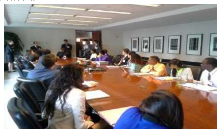
(Above: YAB Students at Chadbourne & Parke LLP, learning from lawyers how to conduct due diligence on their acquisition targets.)

The conference is a transformational experience for many students, as it is their first time visiting New York City. The conference included a guided tour of the financial district arranged by local volunteers. Students visited buildings like Federal Hall National Memorial, and even posed for pics in front of the famous Charging Bull located near Battery Park!