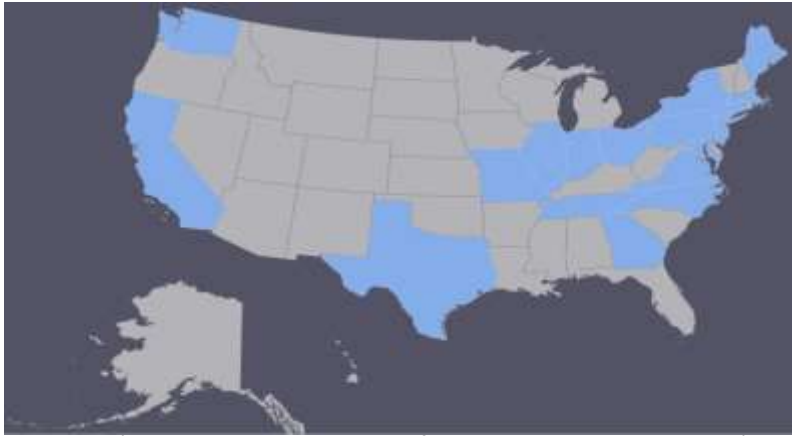
(Above: Representation of YAB students home states)

Notable student experiences from the Summer of 2017 include: