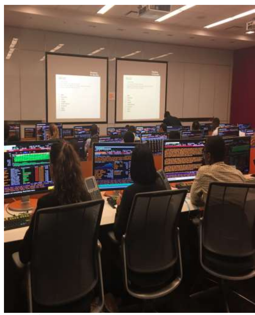
(Above: YAB Students Bloomberg Headquarters, competing in a Stock pitch).

The conference is a transformational experience for many students. The conference included a guided tour of the financial district arranged by local volunteers. A unique opportunity for students this year was the visit to One World Trade Observatory. Students even posed for pictures in front of the famous Charging Bull located near Battery Park!